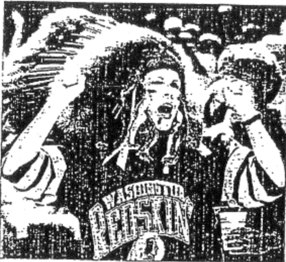
The Indian Girl cheers on the Redskins during their opening game.